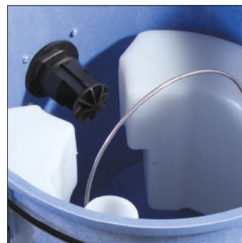
Tank within a Tank