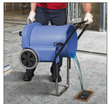
Tipper Handle for Clean Emptying